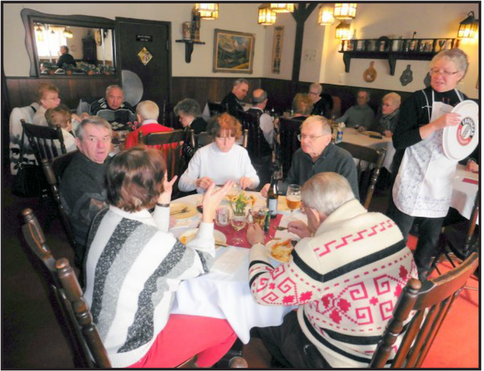
Sunday Dinner at the CLUBHOUSE.